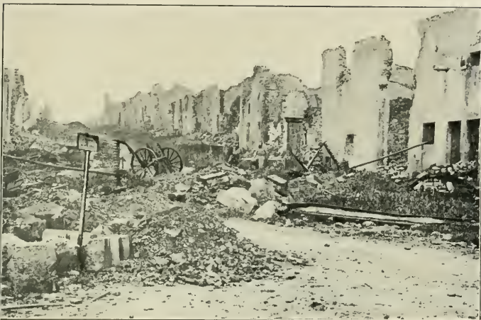
THE ROAD TO METZ